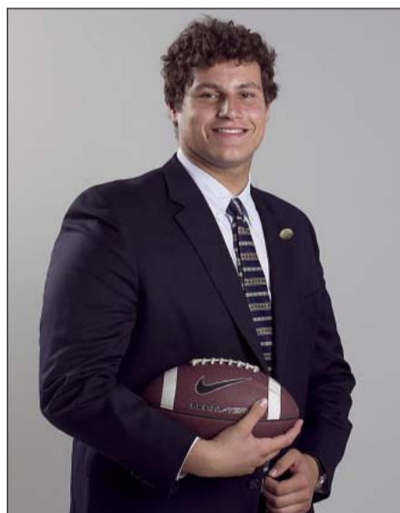
ISAAC STERN UNIVERSITY SCHOOL

Sport(s): Tennis. GPA/SAT: 3.92/2200. Class rank: 1st. College: Princeton. Athletic honors: Overall state singles and doubles champion as senior; ranked No. 1 in the state by USTA. Scholastic honors: Valedictorian, Principal's Honor Roll; AP Scholar with Honors; National Honor Society; Spanish Honor Society. Class schedule: AP Calculus, AP Literature and Composition, AP Chemistry, AP Microeconomics, AP U.S. Government.