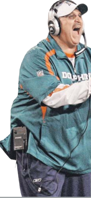
DOLPHINS COACH TONY SPARANO